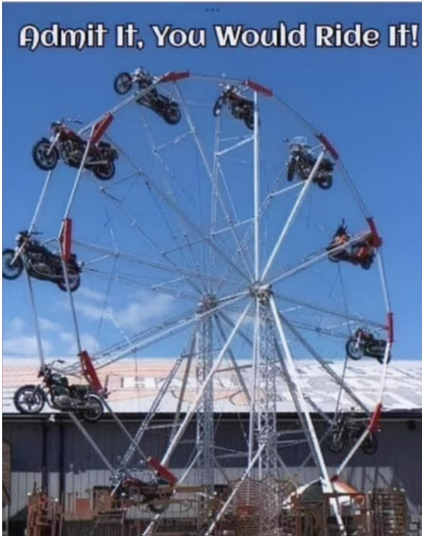
FB Page "I'm a Biker. Love me or Hate me" December 9, 2023