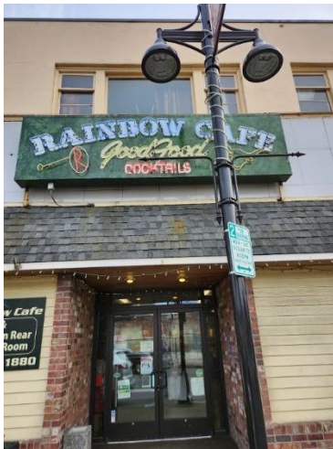
Front Entrance to Rainbow Cafe