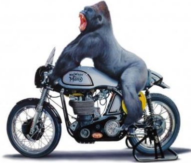
Future Ride Coordinator(s)