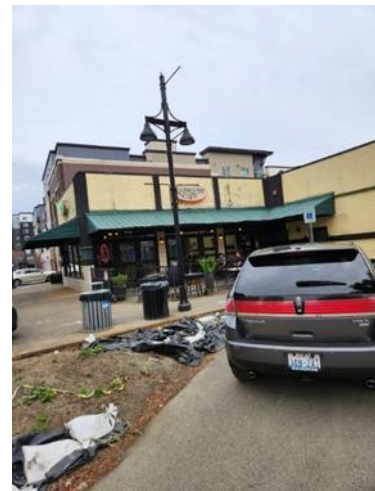
Rear entrance to Rainbow Cafe

There is limited parking in the front but plenty of parking in the back.